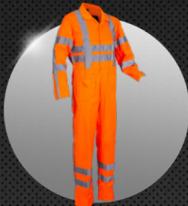
X-VIZ-ULTRA 5805 Art. no. 2.45.807.00